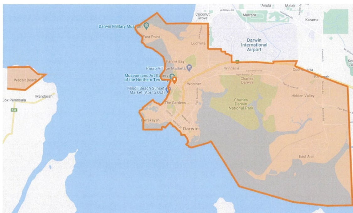
Darwin Middle School – Catchment Area for Enrolment

Families are to note that this criteria is a guide only and not a guarantee of enrolment.